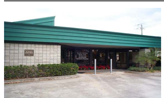
2420 S. Babcock St. Melbourne

These flashes typically cease in a matter of days or weeks when the vitreous has fully detached from the retina. However, some people will continue to see a very occasional flash, and this is usually not a vision-threatening condition.